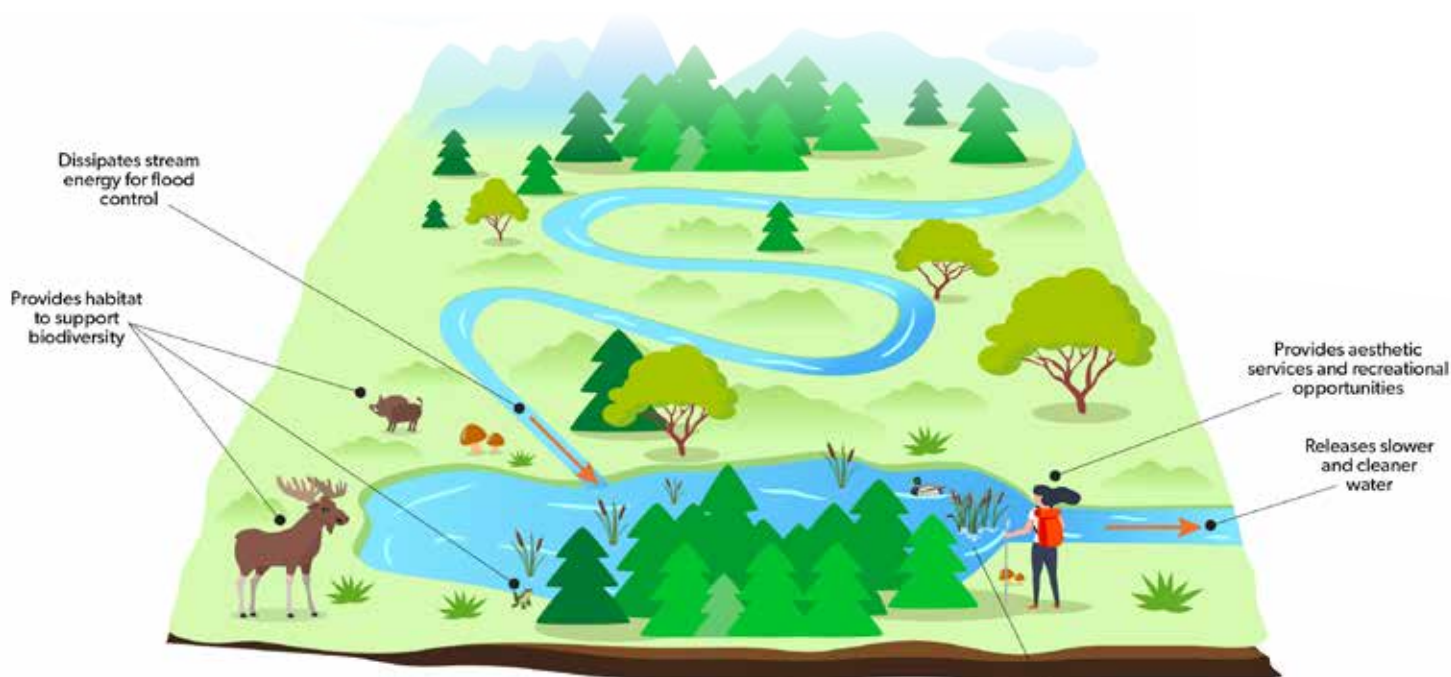
Figure 1: A wetland provides a number of core municipal services that go unrecorded or under-valued because they are not viewed in the same light as engineered assets even though they are providing equivalent services.

Natural assets, such as wetlands, forests, and creeks, provide many of the same services to communities as engineered assets. A wetland, for example, provides stormwater management and flood mitigation services that would have to be replaced by an engineered alternative if the wetland was lost. However, while natural assets are key to sustainable service delivery, they are generally not accounted for and/or are undervalued in asset management practices.