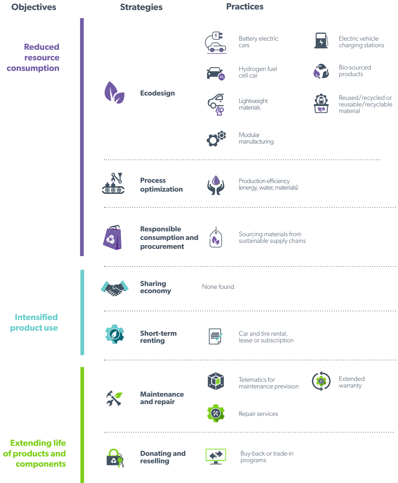
Figure 7-1. Circular economy objectives, strategies and practices found in the automotive manufacturing sector